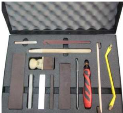
Maintenance tool case

It includes a set of grinding stones and slotters for the preparation of all types of commutators and slip rings.