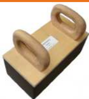
Double-handle grinding stone