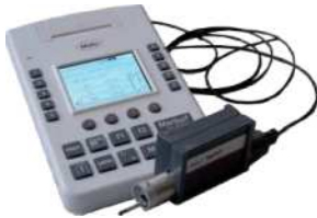
M300C roughness meter

Optimum carbon brush performance depends on the surface roughness of slip rings or commutators being maintained within recommended values.