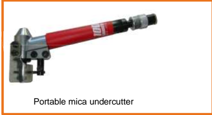
Portable mica undercutter