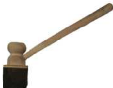
Grinding stone with adjustable handle