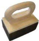
Single-handle grinding stone