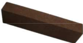
Tower-type grinding stone