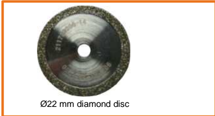
Ø22 mm diamond disc