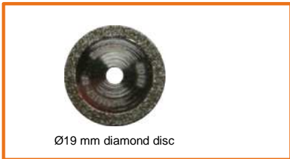
Ø19 mm diamond disc